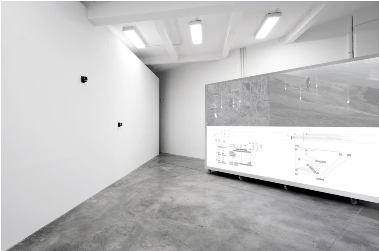
It is hard to find a polyphonic body – exhibition view